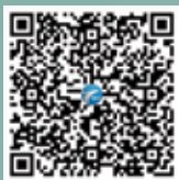
Scan the QR to read “Opinions: The Balance of Power.”

E-mail magazine@alpa.org to submit an article for the “Opinions” Department.